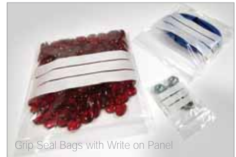
Grip Seal Bags with Write on Panel