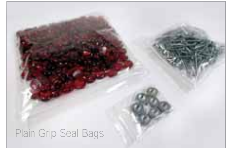
Plain Grip Seal Bags